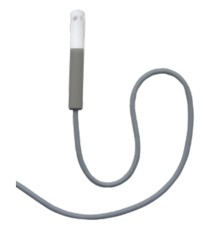
Fig.1. View of P18S transducer.